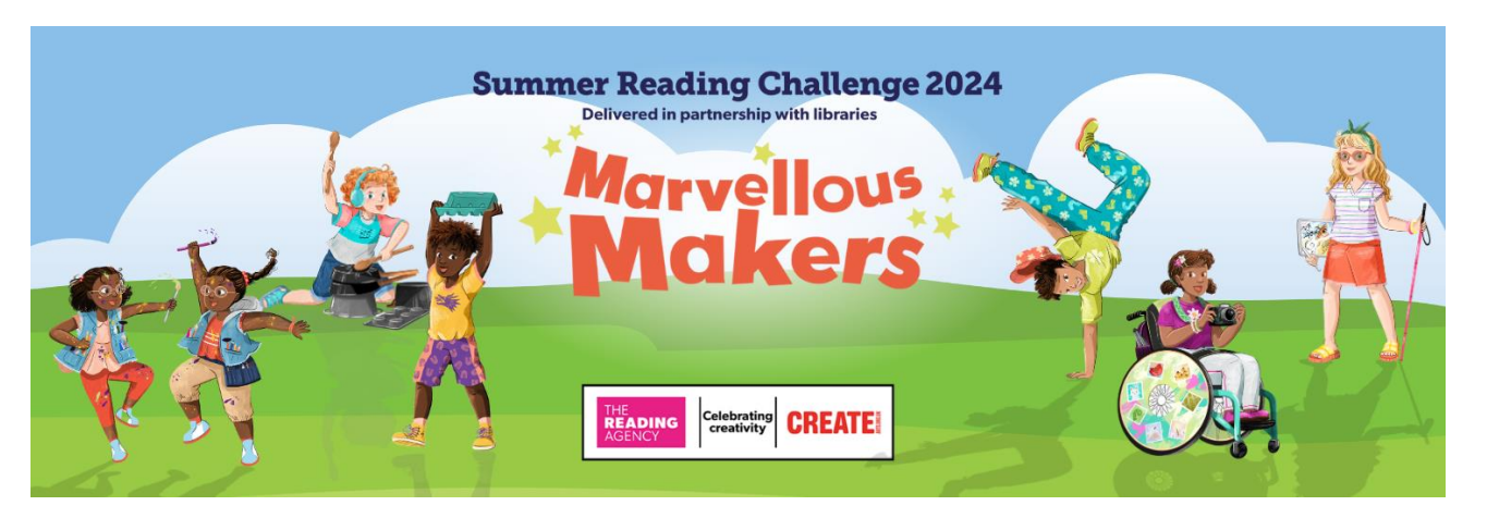
Summer Reading Challenge 2024, Marvellous Makers at Inspire libraries 6 July - 1 September

Libraries in Nottinghamshire are looking forward to a summer filled with reading and creativity as the Summer Reading Challenge returns this July. Produced by The Reading Agency and run in libraries across the country, the Summer Reading Challenge is a brilliant way to maintain children's reading enthusiasm throughout the summer break.