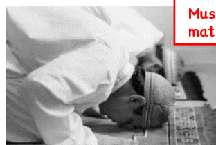
Muslim prayer mat and beads