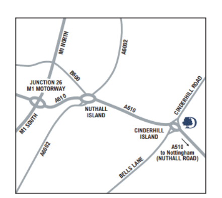
Doubletree by Hilton Nottingham - Gateway Hotel, Nuthall Road, Nottingham NG8 6AZ

Strategically located on the A610, 1 mile from Junction 26 of the M1 motorway, and 3 miles from Nottingham city centre, with 200 free car parking spaces on-site. The hotel benefits from excellent public transport links with bus stops that connect to the heart of the city just steps away, and Phoenix Park tram stop located less than half a mile from the hotel. Nottingham train station is located 4 miles away.