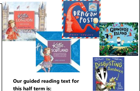
Our guided reading text for this half term is:

In our R.E. lessons we will look at 'What do Christians believe?', learning about the Christian holy book and places of Christian worship. We will also look at the Harvest Festival as a time to be thankful. In art we will be looking at 'Spirals', using different media to create spiral artwork, including using music to see how this can influence our imaginations and the pieces we produce.